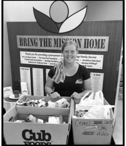
The City of Hastings collected over 200 pounds of food at "Movie in the Park" events throughout the summer and early fall.

Thank you to the many donors and partners in the Hastings community who make the mission of Hastings Family Service possible. Your support is deeply appreciated!