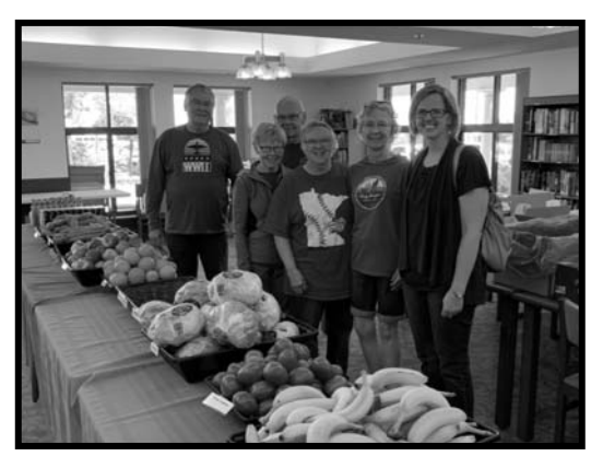
St. Phillip's Church members helped with Market Cart distribution at Oak Ridge Manor.