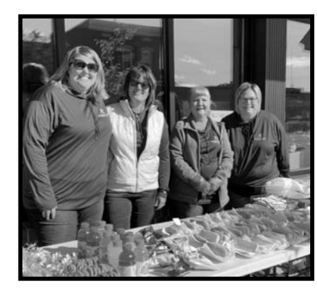
Affinity Plus grilled and served hot dogs at HFS as a part of their "Plus it Forward Day" in October.