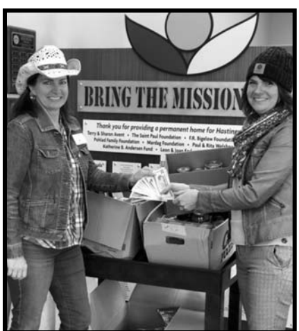
first annual Monster Mash, bringing in $370 and 131 pounds of food!