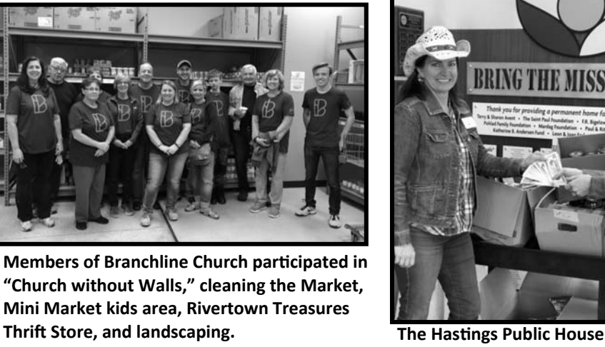
The Hastings Public House hosted its