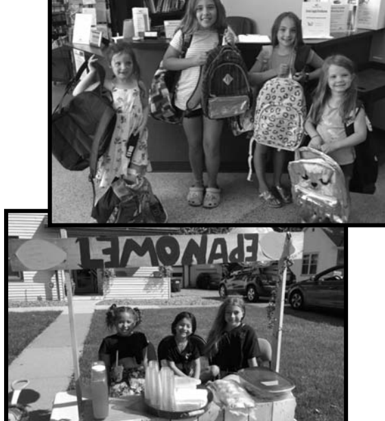
Several groups of local kids made a big difference this summer holding lemonade stands to benefit the School Supply Program.