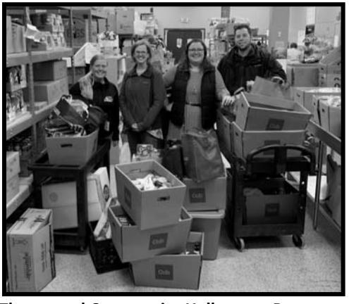
The annual Community Halloween Party, sponsored by the City of Hastings, Hastings Community Education, and the Hastings Area Y, collected 1,070 pounds of food for the Market Food Shelf this year.