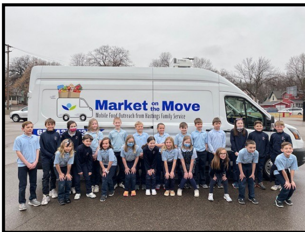
St. Elizabeth Ann Seton School hosted a school-wide food drive, collecting 597 pounds of food and $498!