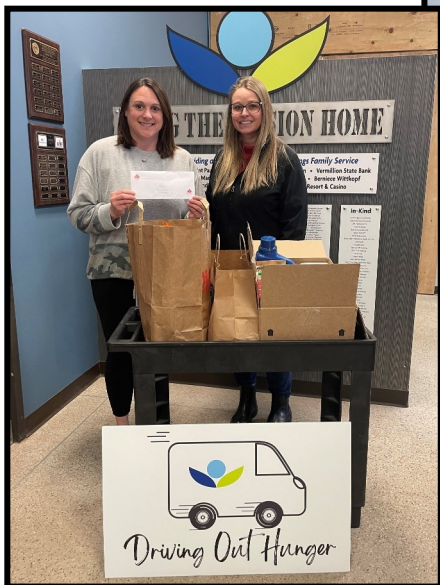
DCA Title collected food and funds to support the HFS Market Food Shelf!