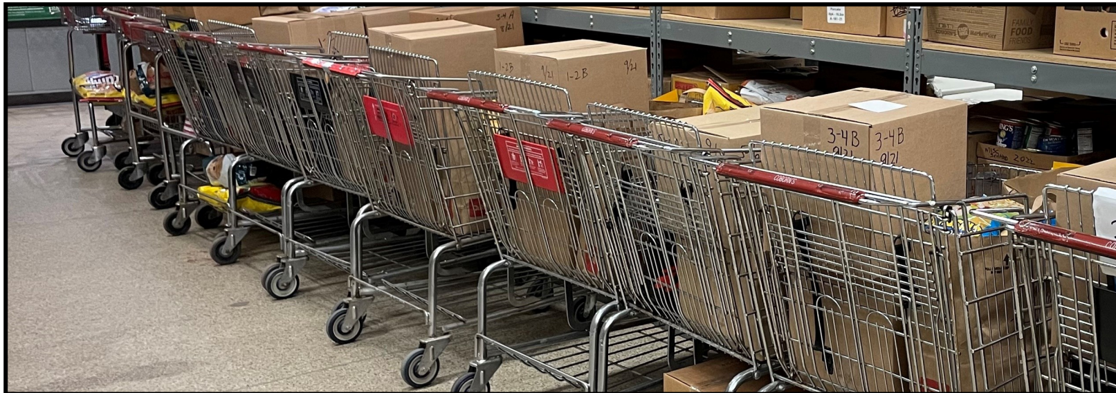
Carts of food lined up in the warehouse in preparation for the day's drive thru food appointments. Produce and refrigerated items are added to the carts before they are wheeled out for our neighbors to pick up.

The past two years have been a time of incredible growth for the HFS Market Food Shelf. As the need for food assistance increased, HFS responded by expanding the offerings under the Market Food Shelf, providing more options and more accessibility for our neighbors. The results are exciting new programs and distribution models, as well as additional staff capacity to support these programs and volunteers.