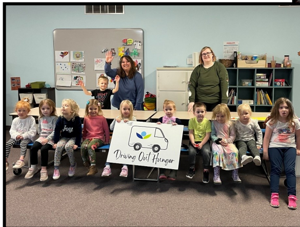
Hope Lutheran Christian Preschool collected 128 boxes of cereal for the HFS Market Food Shelf!