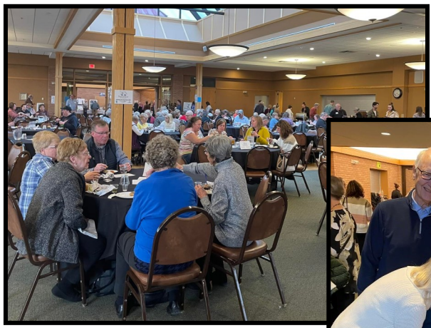
Those in attendance enjoyed sampling specialty appetizers and beverages from participating restaurants and participated in the silent auction and a variety of raffles.