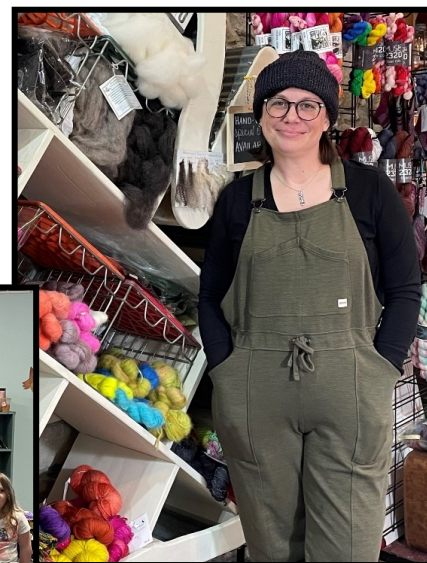
Muse2320 Fiber Co. collected over $2500 for the HFS Market Food Shelf during the MN Yarn Shop hop!