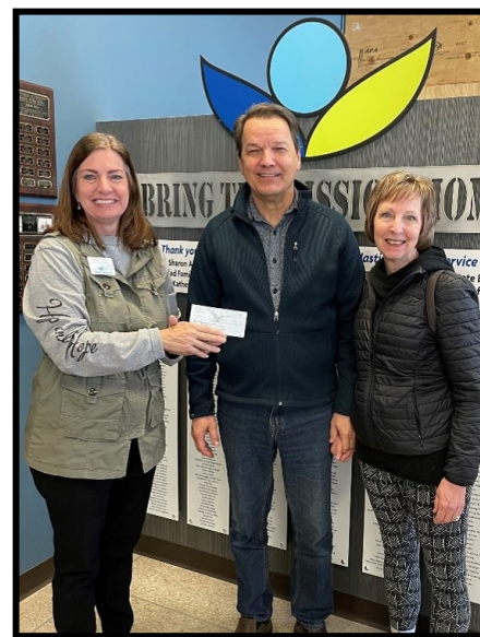
The Journey Church congregation is Driving Out Hunger with a $10,000 gift to help HFS feed hungry families!