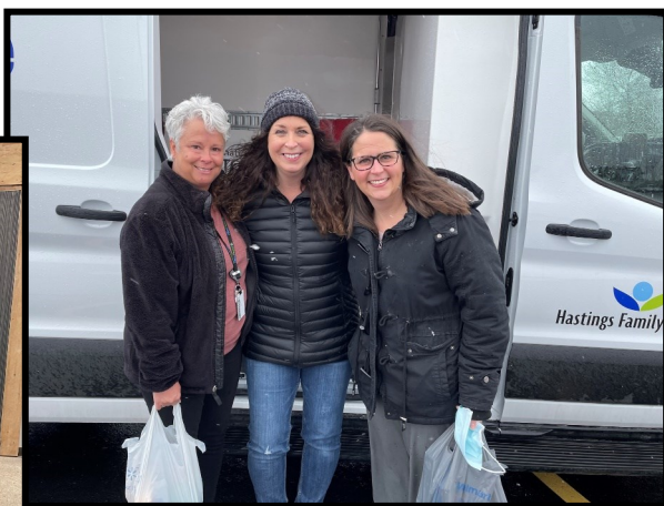
Allina Health Hastings Clinic hosted a reverse food truck event in their parking lot!