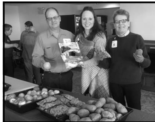
Thank you Allina Health for providing funding and volunteer support to the Market Cart program!