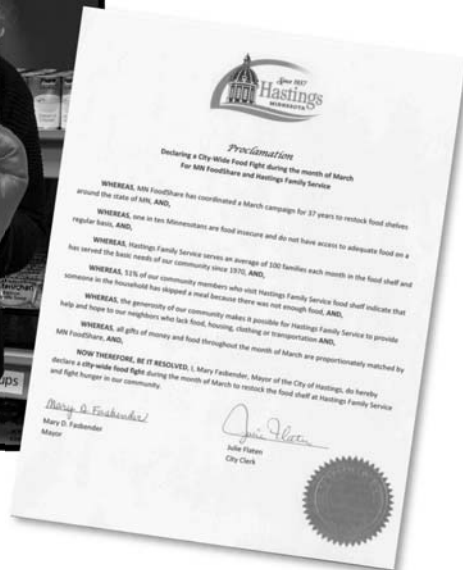
Mayor Mary Fasbender proclaims a City-Wide Food Fight against hunger during MN FoodShare!