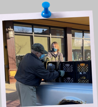
104 volunteers worked 406 hours to make it all possible