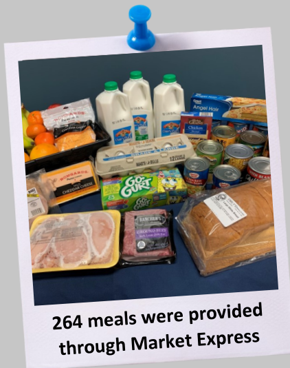
264 meals were provided through Market Express