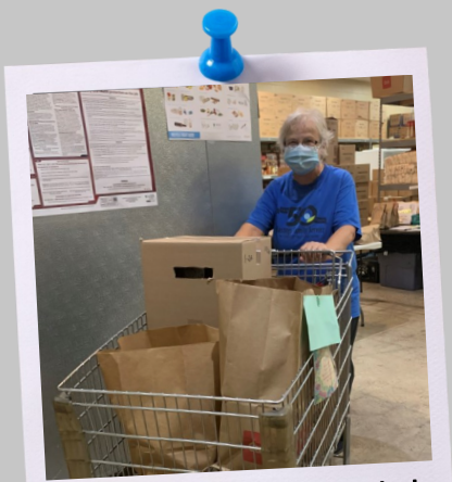
2,277 meals were provided through the Market Food Shelf

Here's a quick look at the impact Hastings Family Service makes in the Hastings area community in one week, taken during a week in January 2022.