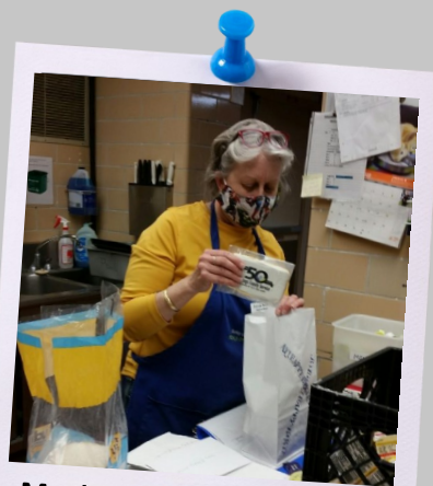
Meals on Wheels delivered 287 hot and 20 frozen meals