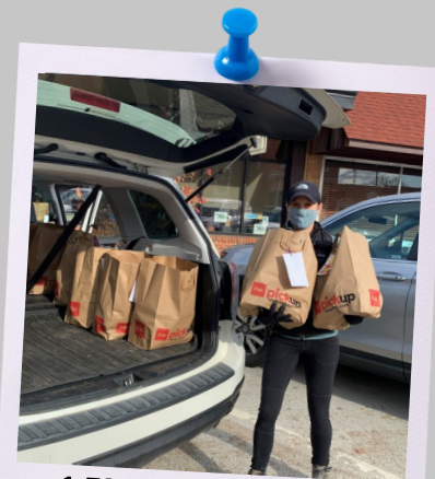
1,734 servings of fresh produce were delivered to seniors through Market Cart