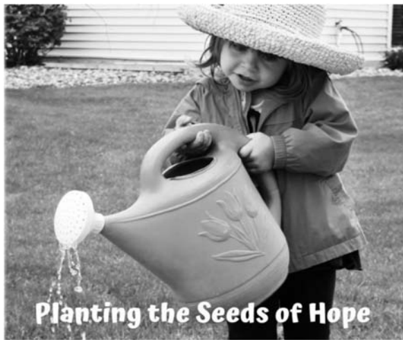
Planting the Seeds of Hope

THANK YOU Merchants Bank! Your partnership and generosity is deeply appreciated!