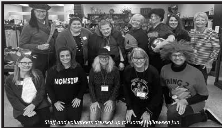
Staff and volunteers dressed up for some Halloween fun.