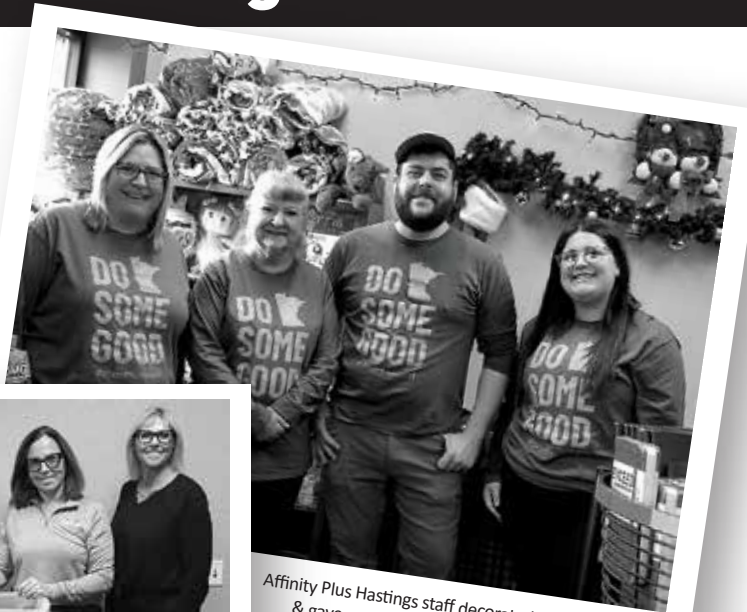
Affinity Plus Hastings staff decorated for Project Share & gave carnations to Meals on Wheels neighbors.