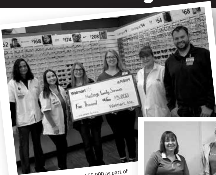
Walmart Hastings donated $5,000 as part of their Health & Wellness Days of Giving.