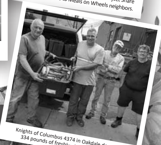
Knights of Columbus 4374 in Oakdale donated 334 pounds of freshly picked sweet corn.