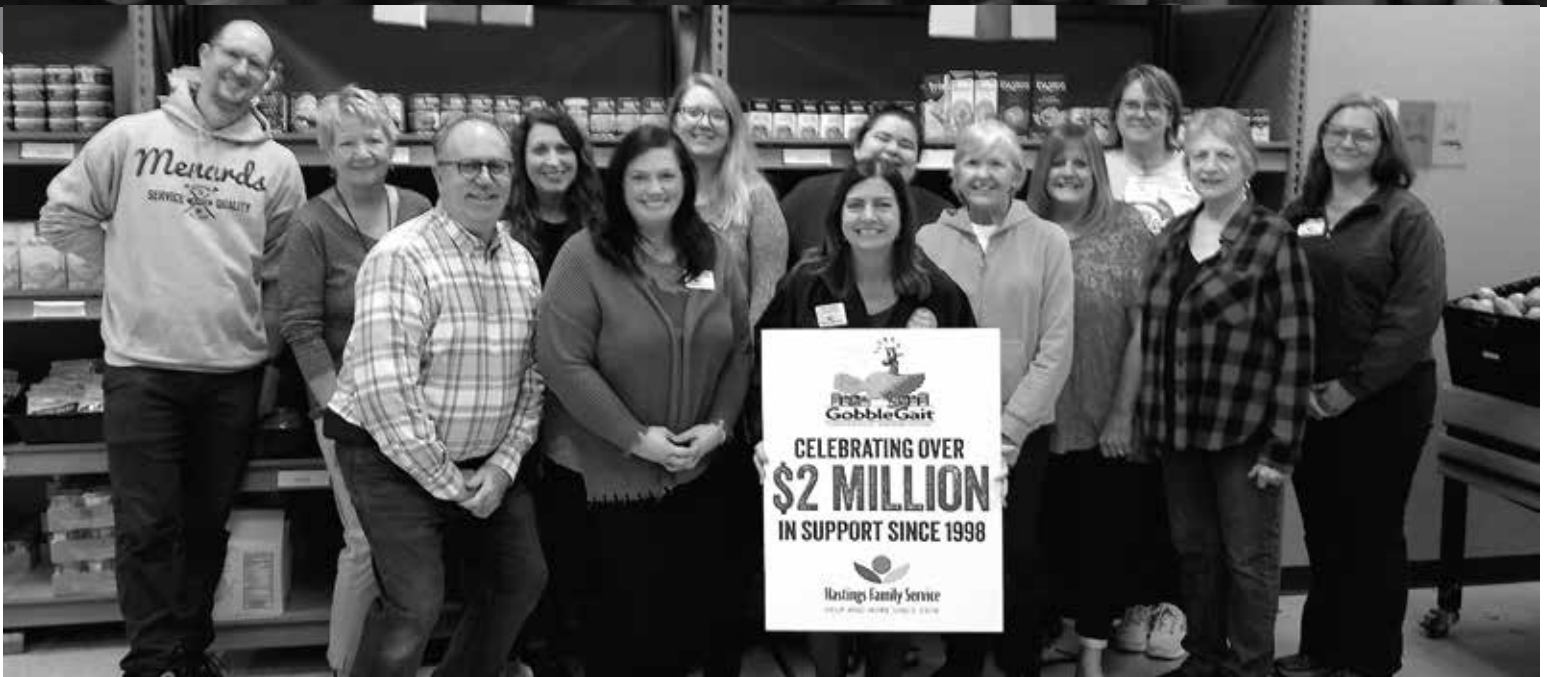
HFS staff and volunteers gather in the Market to thank all who have generously supported Gobble Gait since the race began in 1998.