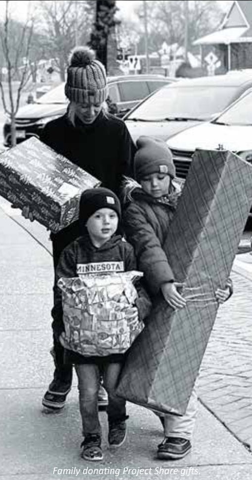
Family donating Project Share gifts.

Project Share holiday assistance provides gifts for children and food for the holidays.