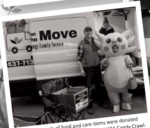
1,143 pounds of food and care items were donated at the Community Halloween Party and DBA Candy Crawl.