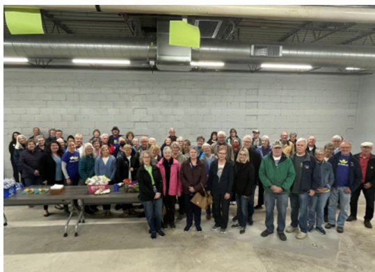
Hastings Family Service purchased the adjacent building on June 30, 2021. The new space will allow for the re-opening of the in-person Market food shelf while continuing the Market drive thru option.