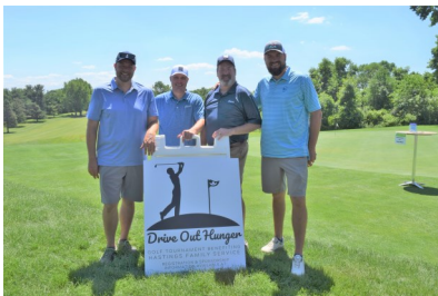
HFS launched the first annual Drive Out Hunger golf tournament!