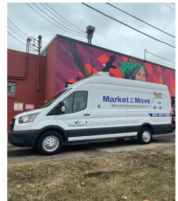
Market on the Move (MOM) was outfitted with a lift gate and refrigeration unit! The city added a beautiful mural on the back of the HFS building.